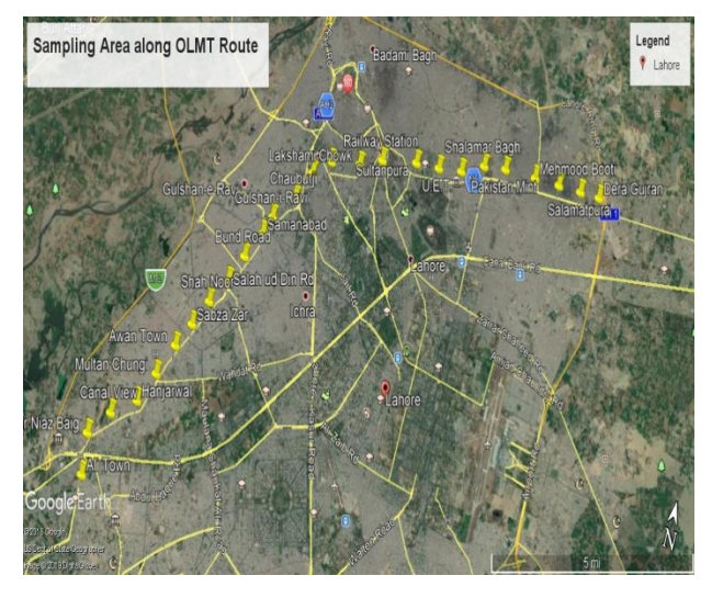
Figure 1: Sampling area

Sampling locations along the metro train stations are shown in Figure 1. This Orange Line Metro Train (OLMT) project was the country's first metro train. mostly elevated line and underground at one point. It will cost 1.6 billion USD and connect Thokar Niaz-Beg (Raiwind Road) with Dera Gujran (Ring Road) via Multan Chungi, Chauburji, Railway Station and G.T. Road. 2.5 lac passengers per day would be benefited from this project (Rizvi, 2015). This project is associated with many health effects like noise, air and soil pollution. This impact could be temporary and permanent to the environment.